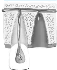
KNOCKED OUT TOOTH