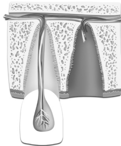
KNOCKED OUT TOOTH